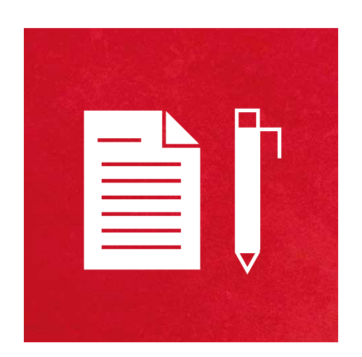
Step 1 Your initial brief is taken