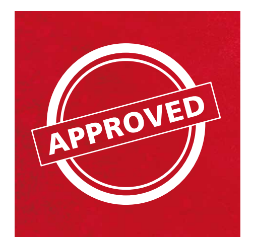
Step 3 Customer and retailer sign off on units