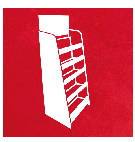
Step 2 Creation of concepts, samples and mock ups