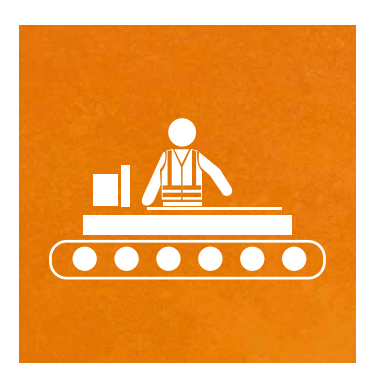
Step 6 Displays are manufactured